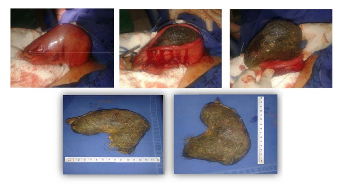
Image 2. Gastric and duodenal trichobezoar made up of hair and intestinal digestive juices. Note the detachment of the trichobezoar tail on the lower end. Weight: 350 grams.